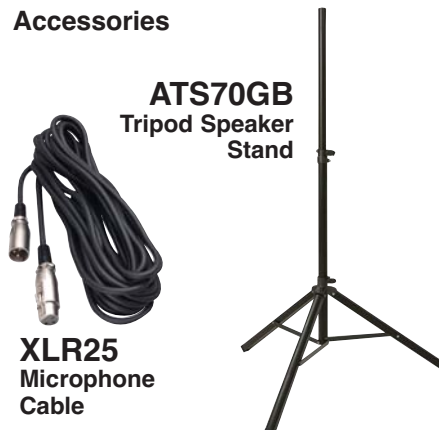
XLR25 Microphone Cable