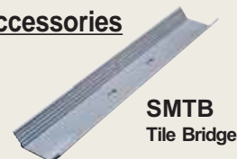
SMTB Tile Bridge